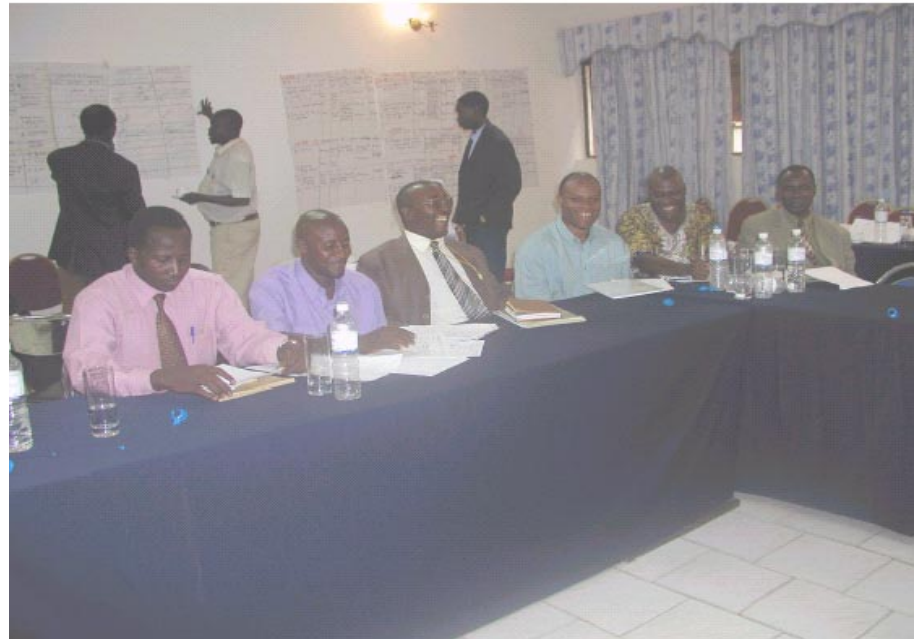
Some of the participants who attended sustainability workshop in Kanungu district